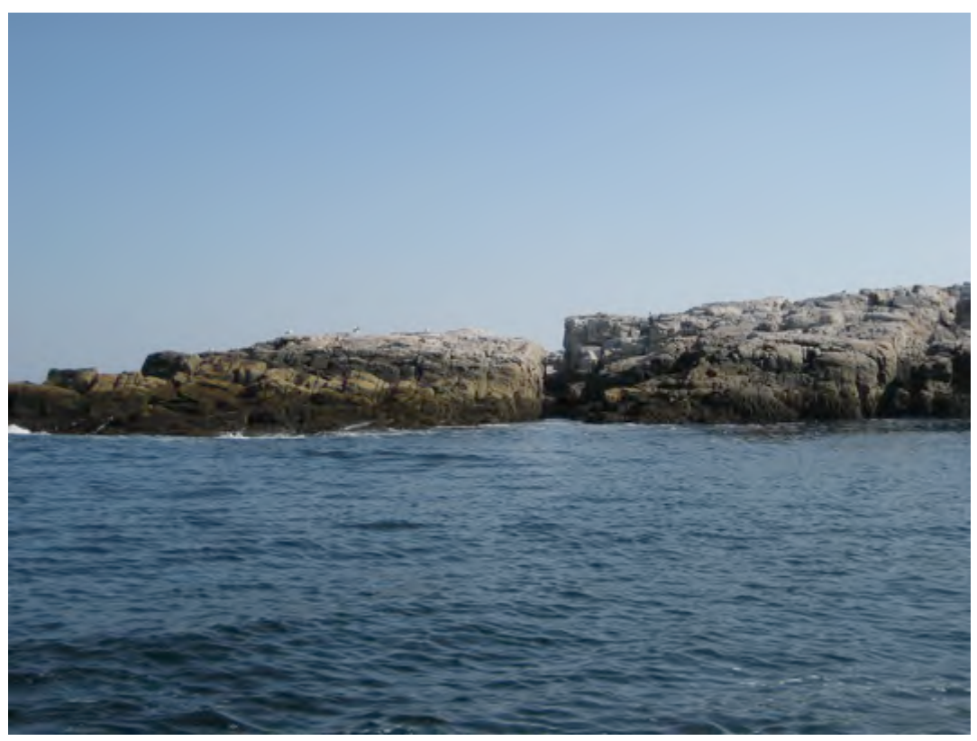
Trap Dike on Appledore's North End

The geology of Appledore is interesting, particularly to my son-in-law—a geologist with the Army Corps of Engineers. The northern end is bare ledge that has been cut by nature into large blocks that look man-made, as if it had been a quarry. The area is populated by "trap dikes" long empty tunnel-like vertical clefts in the granite radiating from the shore toward the interior. The trap dikes are created by erosion cutting though softer stone surrounded by granite.