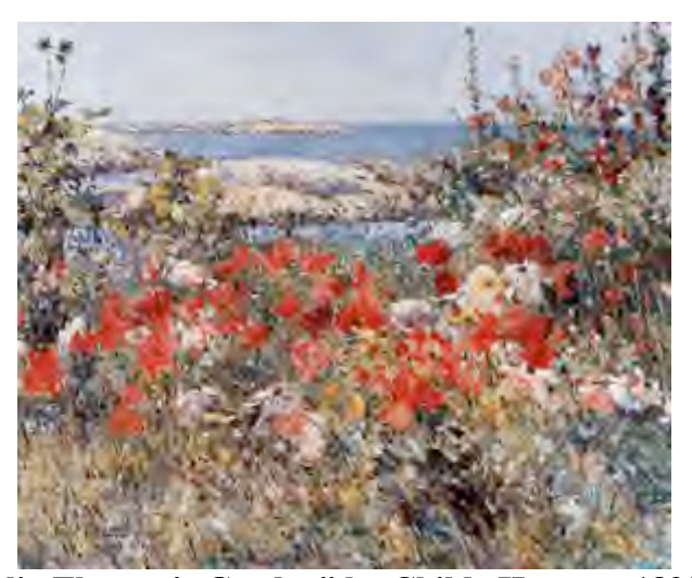
"Celia Thaxter's Garden" by Childe Hassam, 1890

As time passed Appledore House became a less popular destination, its decline hurried by the development of other resort hotels on the mainland, difficulty of transportation to the hotel, and death of a famous resident. It burned down in 1914, ending Appledore Island's role as a tourist attraction.