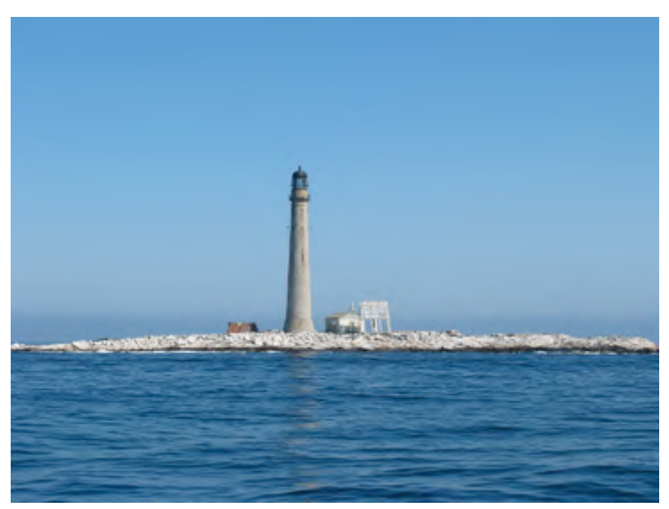
Boon Island Light

In 1799 a low wooden day marker was placed on Boon, followed by a stone marker (cairn) when the wooden marker was washed away after five years. This was followed in 1811 by a 32-foot stone lighthouse, to be replaced by a 49-foot stone lighthouse in 1831. In 1855 the present lighthouse became operational. Standing 133 feet high, it is the tallest lighthouse on the Atlantic coast. For many years it was manned with light keepers and their families. The reports that come down to us are of the devastating isolation of life on the ledge—no vegetation, no protection from winds and storms, no place to keep a boat, and all supplies boated in only when weather allowed. The half-life of a happy light keeper was short.