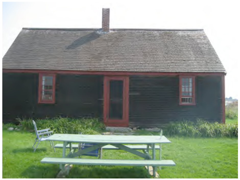
Restored Samuel Haley House, 2011

original four, and it is missing the widow's walk and porch.. Still, the current house has the DNA of the 1800 Samuel Haley House.