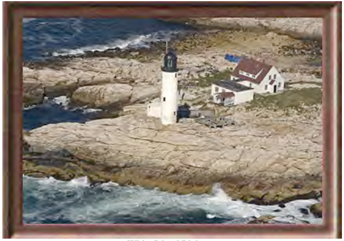
White Island Light

Since 1986 it has been unmanned, as are all lighthouses on the Atlantic Coast except Boston Light. The light keeper's house and a wind tunnel giving it access to the lighthouse still exist. For 150 years the fifteen-second flashing white light has kept vessels from disaster on the Isles of Shoals. I'd call that a good investment.