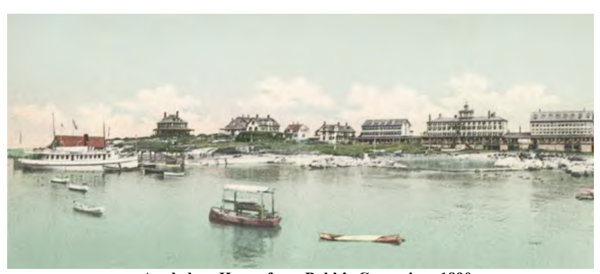
Appledore House from Babb's Cove, circa 1890