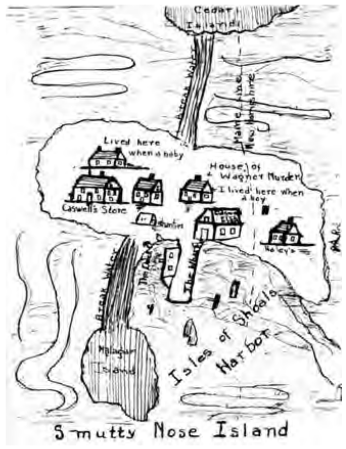
Smuttynose circa 1880

The Mid Ocean House had been converted into a store operated by Lemuel Caswell from Star Island. In 1911 the hotel burned down—the typical end of remote hotels in the days of gaslight and coal stoves. The hotel and all of the houses are now long gone, marked only by foundation stones; only the much-rebuilt and relocated Haley House remains. A second building, called Gull Cottage dates to the 1950s.