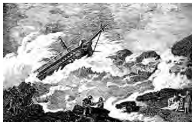
Wreck of the Nottingham Galley, 1711

In February of 1944 a 428-foot British freighter, the Empire Knight , went onto Boon Island and broke into two sections. The stern sank in deep water about 1½ miles from the island. The vessel's hold carried about 16,000 pounds of mercury in glass flasks; some of it was released but the bulk is still intact at 260 feet. As one can imagine, Boon Island swordfish are not much sought after.