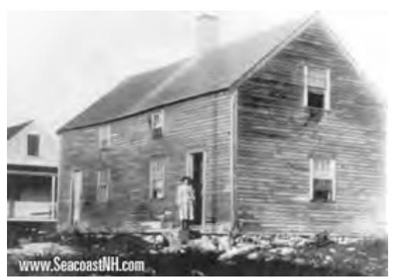
The Hontvet House circa 1880

fishermen. His ambitions were certainly not being realized, so he hatched a plan to correct the situation.