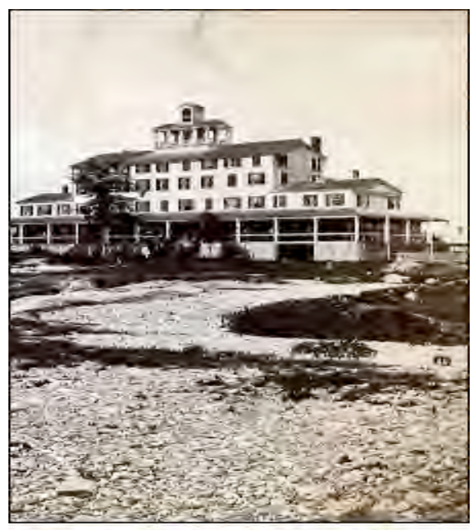
The original Appledore House built 1847